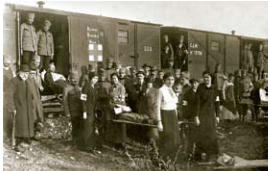
Reception of the wounded at the Railway station, Cacak 1914

Cacak from the time of Austrian occupation is