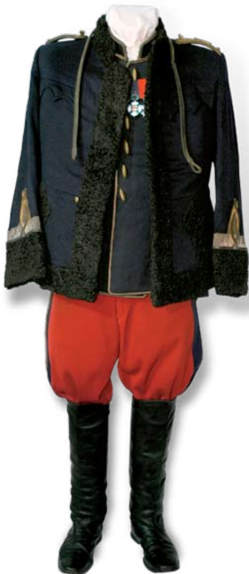
Uniform of a major of the Royal guard