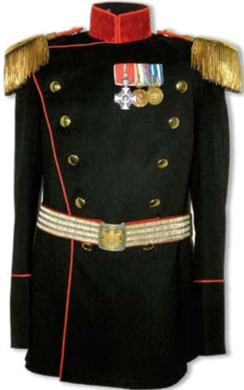
Parade mundur of headquarters' major, before 1912

At the beginning of the 20 th century Cacak was the base of the Tenth Infantry Regiment 'Takovo' which continued tradition of the battalion of the same name formed after the Second Serbian-Turkish war in 1878. By the decree on 27 th March, 1897 it became the regiment and two years later it got the name 'Takovo'. The barracks were built for this regiment on the basis of architect Dragutin Djordjevic project in Cacak on 1902. It moved to