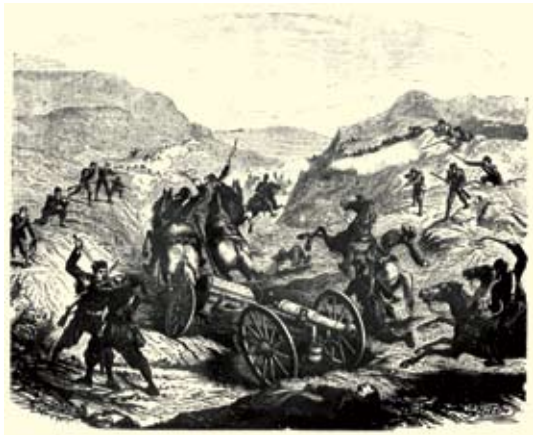
Assault of Serbian infantry at Turkish battery on Javor, 1876