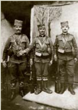
Three soldiers, 1912

He was a student of secondary grammar school in Cacak. He died as a chief of staff of the coastal crust war effort in the First Balkan War.