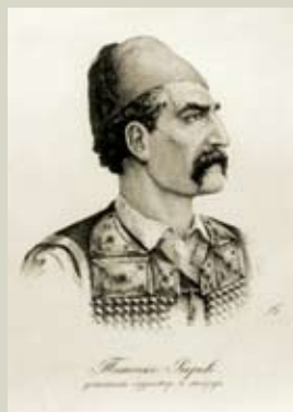
Tanasko Rajic work of Josip Uhlik

front on the West Morava, Prince Milos Obrenovic went to Valjevo District. He supported the fall of Palez and Valjevo. When he came back with the new troops and two canons to Ljubic on 1 st June, the battles with Turks restarted. The troops under the command of Kara-Mustafa were defeated in Dragacevo and Imsir Pasha started a decisive battle with rebels. On 6 th June the battle was held at the foot of Ljubic hill and Cacak trench, but the Turks made rebels to retreat to Ljubic hill and they retreated to the trench after Imsir Pasha was killed. It seems that it was not noticed by any of the sides and battle lasted until the night. Tanasko