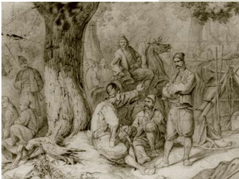
Rebels' camp, work of Anastas Jovanovic (History Museum of Serbia, Belgrade)