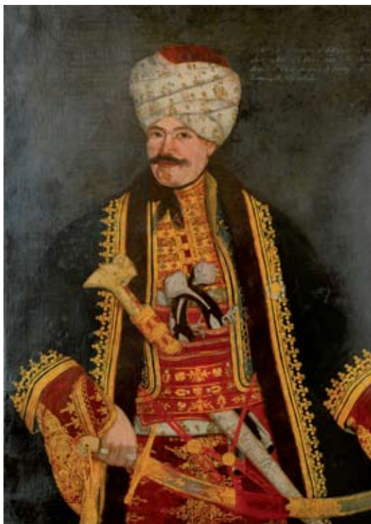
Master Jovan Obrenovic, work of Uros Knezevic (National Museum, Belgrade)

As the main part of the Turkish army was fighting in Cacak, the rebellion was spreading easily in neighboring districts. When Turks heard that Prince Milos Obrenovic was going from Rudnik District towards Kragujevac they left the town. Other big towns would be liberated soon, but coming of Hurshid Pasha on the Drina and Marshli-ali Pasha on the Morava would prevent liberation of the last Turkish bastions in Serbia.