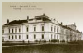
Barrack of X 'Takovo' infantry regiment in Cacak

Agricultural Association, Rider’s Association, Falcon and Shooting Association, Women’s Associations and Red Cross. Secondary Grammar School became the school with six grades till the end of the century. Before the Balkan wars the number of inhabitants increased and was 5,600.