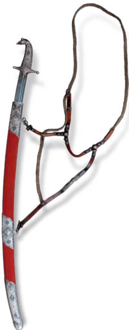
Trophy Sabre of Duke Stepa Stepanovic, received by Sukri Pasha in the moment of surrendering Jedrene on 26 th March 1913