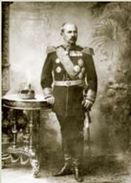
General Kosta Protic, Chief of Supreme Command Headquarters, 1877-78

After Serbian-Turkish wars 1876 - 1878 trophy ('gold') arms were given only to general Kosta Protic (Pozarevac, 1831 - Brestovacka Banja, 1892). Prince Milan Obrenovic presented him in token of nice memories and his patriotic and faithful service 'honorary sabre' with dedication: 'To my Headquarters' Chief, General Kosta S. Protic, Supreme Commander, Serbian Prince, Milan M. Obrenovic IV, in the name of ruler's recognition gives this sabre for exceptional