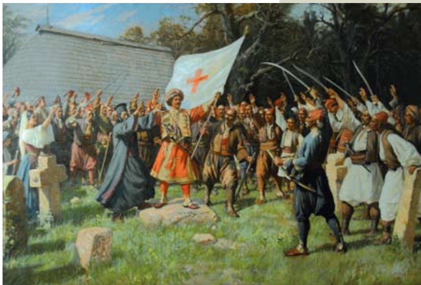
Takovo Uprising, work of Paja Jovanovic (National Museum, Belgrade)

Arsenija Loma would attack Rudnik, Lazar Mutap Cacak, while Petar Topalovic Kragujevac. The battles started spontaneously, so when Milos Obrenovic gave speech at the fair in Takovo on 23 rd April, 1815, Rudnik had already been liberated. Prince accepted to be the leader of this Uprising and in front of his house in Crnuce he unfolded his vojvoda's flag and people were called to start fighting and closing roads to Turks.