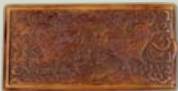
Cigarette case, oflag XIII B, in Nuremberg, 1941-1945