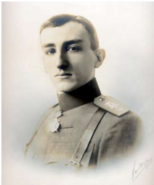
Prince Djordje Karadjordjevic as a major

‘Ovcar and Kablar’ was founded in order to build hydroelectric power plant on the West Morava. In 1911 a new railway connection with Kraljevo was built. Since 1899 there are several newspapers published in Cacak: ‘Ljubic’, and several other official, cultural and political ones. The town had a reading room, choir, and branch of Serbian