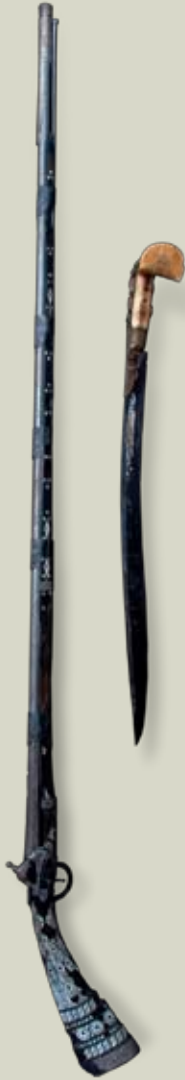
Yataghan and rifle 'dzeferdar' of the family Stovrag from Banjica, first half of the 19 th century