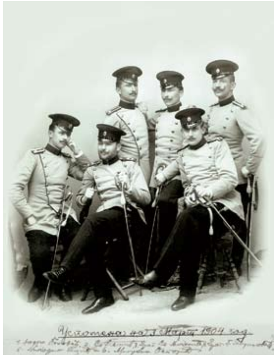
Group of officers of X 'Takovo' regiment, 1904

The profile of the town Cacak got in the last quarter of the 19 th century. The cutting of street and fast building were in accordance with the first urban plan from 1893. Agriculture was still