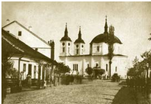
Cacak, about 1875

Obrenovic and Cacak became the administrative centre of the South-west Serbia. After the church reconstruction in 1834, konaks of the highest state and prelates representatives were built in its vicinity. In 1837 Secondary Grammar School