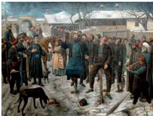
Impalement at Stambol gate, work of Nikola Milojevic (National Museum Kraljevo)

The thought about a new rebellion against the Turks did not die away at any moment. It was also supported by Turkish repressions and news