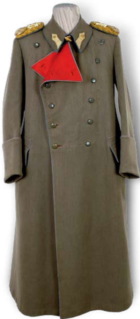
Marshal's overcoat, after 1934

MARSHAL PETAR BOJOVIC (Misevici, 1858 - Belgrade, 1945)