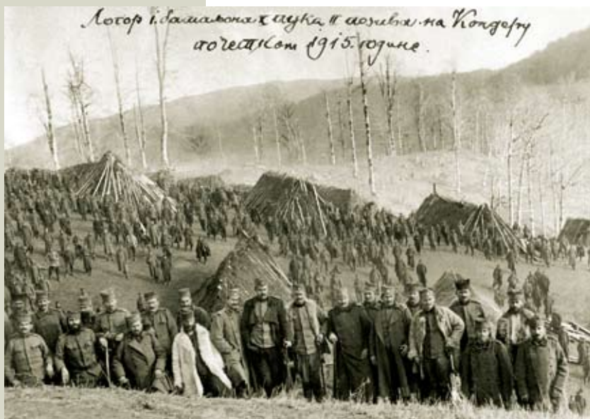
Camp of the first battalion of "Takovo" infantry regiment of II call-up on Konder, 1915