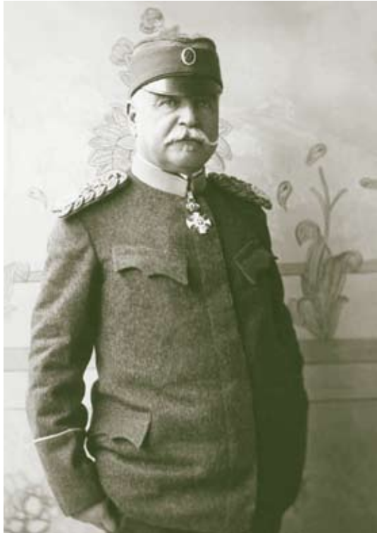
Marshal Stepa Stepanovic

at Konatica it had 2000 soldiers and officers killed and wounded.