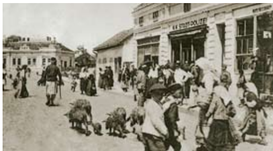
Main Street of Cacak, 1915-1917