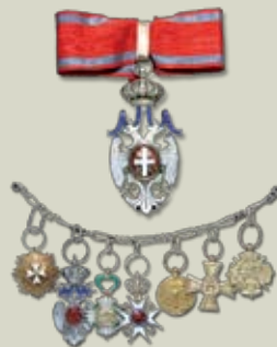
Decoration of White Eagle of III rank and Miniatures of Decoration

In heroic defense of Belgrade, as a reconnaissance he was in French Aero plane squadron and commander of first troop of the second battalion of X staff regiment. He was wounded in assault at Danube Promenade on 23 rd September, 1915.