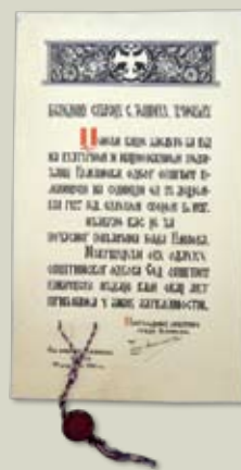
Decoration and Charter of Honorary citizen of Kumanovo

In the First World War 1914 he was a commander of battalion and during retreating in 1915 he was a representative of the commander of X regiment of II call-up.