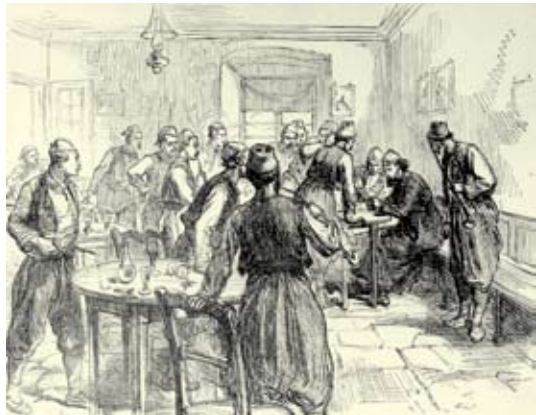
Reading of the last telegram in Cacak, 1876

built in 1875 which followed central European style. The town had its reading room and a theatre. Students continued their studies either in Belgrade or some were going to attend the best European Universities. Their generation with diplomas and achieved knowledge as well as with modern approaches of western culture had a great influence on European like formation of administrative