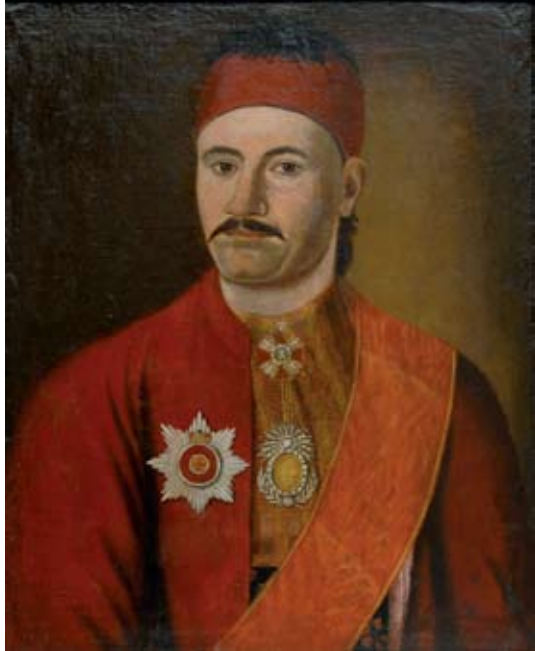
Prince Miloš Obrenović, work of an unknown author