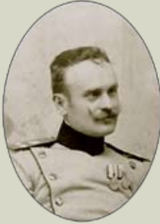
LIEUTENANT COLONEL BOGOLJUB MOLEROVIC (Vracevic, 1876 – Kajmakalan, 1916)

Died as a commander of the second battalion of V infantry regiment in the assault at Virut on 30 th September, 1916.