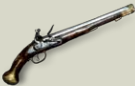
Pistol, first half of the 19 th century