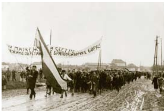
The citizens of Cacak demand to stop the civil war, 1941