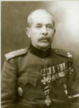
Colonel Mihailo Zisic

In the liberation wars Serbia 1912-1918 he was the commander of Second Army. The rank Marshal (Voivoda) he gained after the battle of Cer in 1914, the first Allied victory in the First World War. The final stage of the Great War was a big breakthrough after the Salonika front, which was accomplished under his command on Dobro polje in 1918. He was awarded the Order of Karadjordje star with swords I rank.