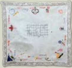
A handkerchief from Banjica prison camp, 1941-42

NATIONAL HERO RATKO MITROVIC (Cacak, 1913 - Cacak, 1941)