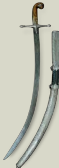
Sabre of Duke Jovan (?) Obrenovic, 19 th century

Portrait of Jovan Obrenovic from 1836 points out social status of a commander in chief, painted in town's costume with a strong oriental influence and details of clothes very precisely painted as it was decorated with golden threads. He is holding a sabre 'samsir' which corresponds to the example preserved in his konak in Brusnica.