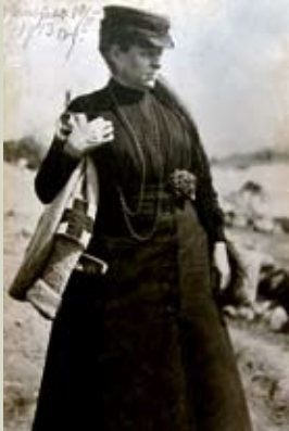
NADEZDA PETROVIC (Cacak, 1873 - Valjevo, 1915)

The painter helped her home land as a volunteer nurse in the Balkan Wars and painted scenes in Kosovo and Prizren. She died on duty in Valjevo military hospital.