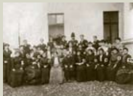
Voluntary nurse course in Cacak, 1909