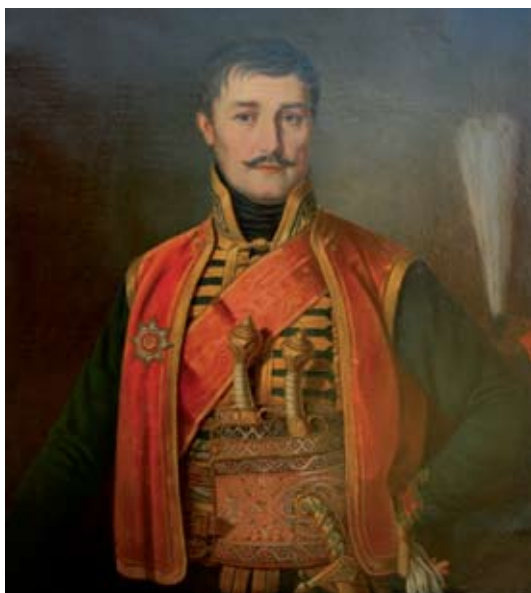
Karadjordje Petrovic, work of V. L. Borovikovski (National Museum, Belgrade)

The wars between Austria and Turkey in the 18 th century were taking place on the territory of Serbia with changeable luck arising hope that people would get rid of many centuries slavery. In the last one, announced in 1788 several thousands Serbs organized in voluntary troops took part as they had rich experience in battles with Turkish army, sieges and taking over towns. Organized in national army they were support to Belgrade vizier Hadzi-