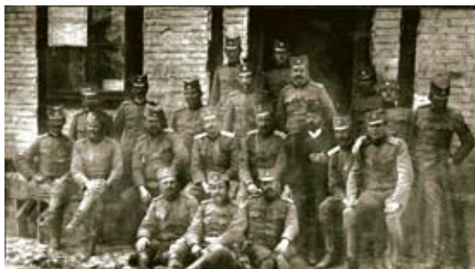
Officers of X Staff regiment 'Takovo', Belgrade 1915

were in Belgrade, and Tenth regiment of II call on the positions near Uzice. Wounds obtained during previous year were hard for healing.