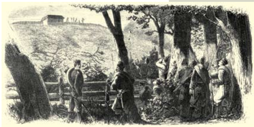
Battle on Javor, 1876

He was a commander of the troop at Ibar in the First Serbian-Turkish War and Division Headquarters Chief. He was killed on Javor leading the assault of Uzice Brigade of II class.