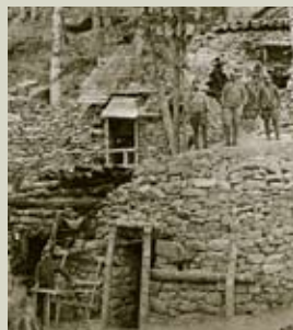
Dugouts at The Salonika Front, 1917-1918.