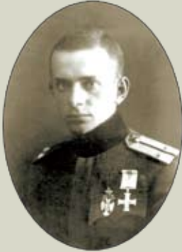
LIEUTENANT MLADEN ZUJOVIC (Belgrade, 1895 - Paris, 1969)

In heroic defense of Belgrade in 1915 he was a sergeant of machine gun combined detachment troop in battles at Danube Promenade, Torlak and Avala. At Salonika Front 1917-1918 he was in machine gun troop of X infantry regiment 'Takovo'.