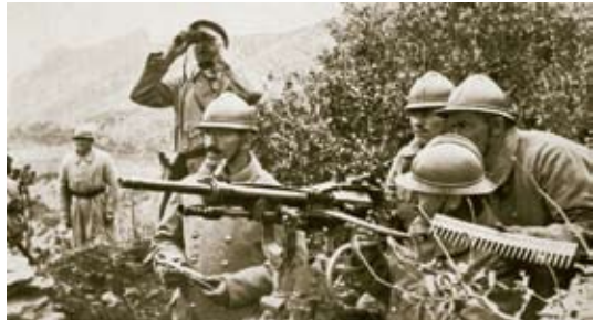
Machine gunner of X regiment below Golo Bilo, 1917-1918

In Yugoslav Kingdom Cacak remained a farming region. Only in 1930 did the Military –technical Institute and Factory of Paper start working. Secondary Grammar school, now with eight