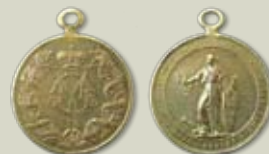
Commemorative volume to war 1876, 1877 and 1878

kalpak on the head. He has a pistol and a sabre of the infantry officer. There are knee socks over the trousers' legs with garters. There are shoes 'opanci' on the feet.