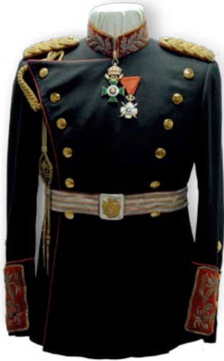
Parade mundur of Staff Brigade General

On October 1941, Cacak Partisan regiment together with Chetnik forces took part in battles for Kraljevo. After the siege ended they started with each other's conflicts. From Partisan command was asked to reform units which were fighting on political basis into Chetnik troops, to abolish revolutionary administrative bodies and remove symbols which were not of state character and then Cacak was attacked. In the fights which lasted two days on 7 th and 9 th November the town was defended, and Chetniks were pushed towards