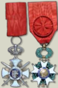
Decoration of Karadjordje Star with swords of IV rank and French Legion of Honor of IV rank

In defending Belgrade he was attacking with his soldiers Austrians six times at Danube Promenade.