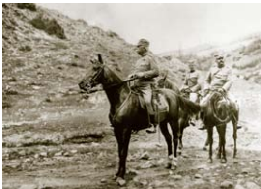
General Stepa Stepanovic visiting border, 1913

After demobilization Tenth regiment was sent to Prizren in order to protect the border. At the