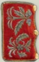
Embroidery detail on the sleeve

A former student of Cacak High school in april war in 1941 , he was a Head of 6 th Army Headquarters.