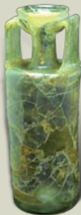
Glass bottle, Prijevor, Culjevina, 5 th century