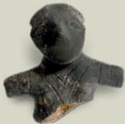
Figurine, Ridjage, Vinogradi, Younger Neolith, Vinca culture