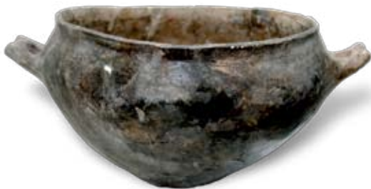
Bowel, Ostra, Middle Bronze Age

The transition into younger Neolith about 4500