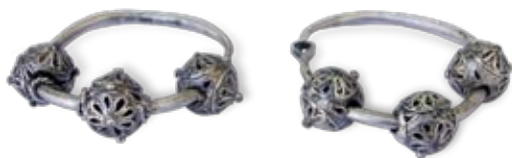
Earrings, Cacak, 13 th - 14 th century

Remains of farming and carving tools from the 14 th century have been found on the estate which once belonged to the church of Virgin Mary. From the remains found in Kostunici an earring and 15 examples of money from the time of emperor Dusan and some unspecified money from the time of the emperor Uros have been exhibited. A glass made of glass from the old church in Trnava