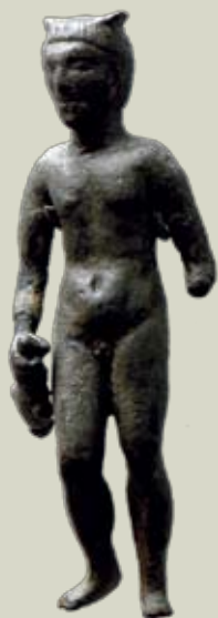
Merkur, Bresnica, 2 nd - 3 rd century