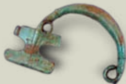
Fibula, Vidova, Older Iron Age

Bronze Age in Lucani, Jancici, Krstac, Guca, Ducalovici and Donja Kravarica contain various jewelries: necklaces, bracelets, glasses or pipe like pendants, tutulas, saltaleons, needles and pincers, whose property was showing the social status of their owners. Urns' shapes and ornaments are connected with Vatina culture which appeared about 1600 B.C. Bronze Age ended by standing out first groups of pre Illyrians and pre Thracians and beginnings of ethnic forming old Balkanize tribes. Great migrations of peoples at the end of the 13 th