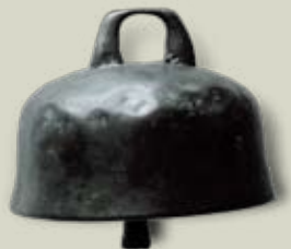
Bell, Jelica, Gradina, Early Middle Ages