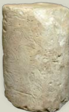
Binjektas, 14 th -15 th century