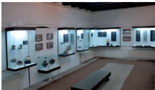
Pre historic period in the permanent exhibition, 2006

The story about the past of Cacak begins much earlier than the first mentioning of its name in the 15 th century. The oldest inhabitants were attracted by river valleys of the West Morava and its tributaries and hilly area of Cacak region, and they built their houses –dugouts and houses made of poles coated with mud, as early as in Neolith (5500 to 3200 B.C.)