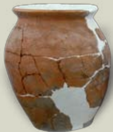
Hearth ceramics, Rosci, Kulina, 10 th - 11 th century

Zapadna Morava, on the Kulina locality, a Serbian settlement was discovered from the 10 th - 11 th century with characteristic ceramics decorated with troughs ('valovnice').