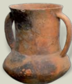
Cup, Ducalovici, Ruja, Early Bronze Age

Necropolis under the tombs on the slopes and in hilly mountain ranges in Dragacevo reveals their presence in this meadow rich area. In the tombs from Early Bronze Age there are no metal findings, while ceramic material such as jugs and cups are connected in their forms with local culture Belotic – Bela Crkva. Graves from developed