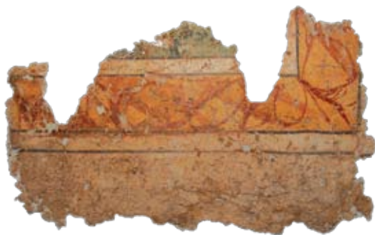
Fresco fragment, Jelica, Gradina, 6 th century

Byzantium did not succeed in protecting its borders from the Slavs who settled the Balkans in the 7 th century. On a hidden elevation above the