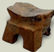
Altar, Bresnica, Aniste, Older Neolith