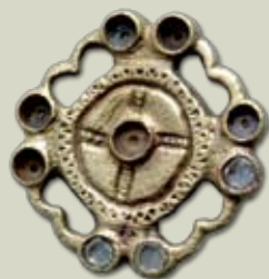
German plate fibula, Jelica, Gradina, 6 th century