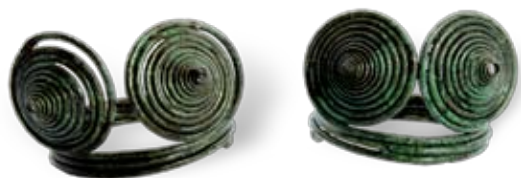
Bracelets, Guca, Grotnica, Middle Bronze Age

Bronze Age which lasted throughout the whole 2 nd millennium B.C. started with migration of Indo Europeans from the steppe of the south region