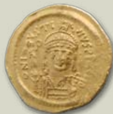
Solid of Emperor Justinian II, Jelica, Gradina, Constantinople 567-578