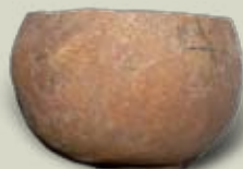
Dish, Ostra, Bakovaca, Older Neolith

On the locality 'Crkvina' in Miokovci, an altar and dishes from pre barbotin phase of proto Starcevo have been found. Hand made ceramics for house usage of classic Starcevo culture and some objects have been found in settlements 'Trsine' and 'Slatina' in the valley of the river Cemernica. The inhabitants, apart from hunting and fishing, were dealing with half nomadic farming, rising tamed animals, weaving and making pottery with bone tools. Are exhibited Axes made of ground stone, bone tools made of stag's antlers, needles, pointed tools, little knives made of flint and obsidian and weights for fishing nets are.