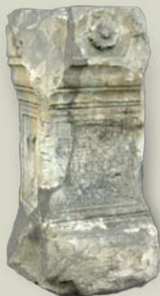
Altar devoted to Jupiter, Jezdina, 197