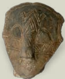
Figurine, Guca, Younger Neolith, Vinca culture