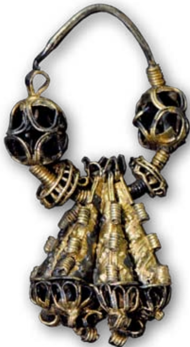
Earring, Kostunici, 14 th century

It belongs to the jewelry and coin remains of Emperor Dusan and coins from the time of the Emperor Uros, from the 14 th century, the village Kostunici near Cacak.