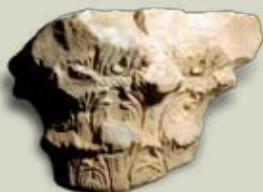
Capitol, surroundings of Cacak, 5 th century

Cacak was on the crossroads, where beneficiary stations were usually built, fortified with ramparts and ditches. Beneficiaries from Claudio's XI legion were guarding roads, following important transports, while consular beneficiaries were supervising tax collecting. It is assumed that II Dalmatian cohort 'Aurelia' was in the regions around Cacak in 176 under the command of tribune Tiberius Claudio Gal because of defending of eastern border from bandits. Money – denars and antonians were found in Goracici as they were in circulation in this region in the 2 nd and 3 rd centuries.