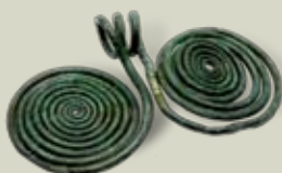
Glasses like pendant, Jancici, Dubac, Middle Bronze Age