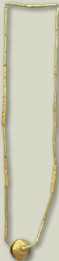
Golden necklace, Atenica, end of the 6 th and the beginning of the 5 th century B.C.

groups and their intercultural intervening at the beginning of Hallstatt. Duke's necropolis belong to the period of time of rise of tribal aristocracy in the 6 th and 5 th centuries B.C. and exceptionally rich material culture whose autohton creations were harmoniously elaborated with imported material from the Apennine Peninsula, Greece, Black Sea Coast and Russian steppes. In the duke's grave weapons of a tribal warrior were found: swords, spears, arrows and shields. The wheel of a cart which carried it to the stake was reconstructed. Grave findings in both tombs consist of golden, silver, amber and glass jewelry, metal dishes, ojnohoe, boxes with bone covers and horse equipment. Imported objects from Greece