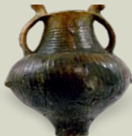
Urn, Jancici, Middle Bronze Age