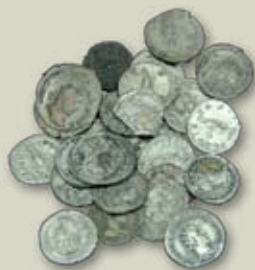
Storage room of Roman money from Goracici, 2 nd and 3 rd century

Fertile valley of the West Morava was divided in the second half of the 3 rd and the beginning of the 4 th century into numerous farming estates. Their owners did not give up comfortable life, that is why thermal baths were discovered in Cacak and in Beljina, and they were built in the style of well organized rustic villas. Dimensions of thermal baths in Beljina point out that they had private purpose. They consisted of rooms for cold and hot bathing, sweating, exercises and body adapting between bathing in cold and hot water. Some of the rooms were painted. A part of the estate in Prijevor was a corn store room, while in Gornja Gorevnica there were several economy objects. Not far from them there were memories built to the cult of dead. On the locality of Culjevina, glass dishes, jewelry and medical accessories were discovered as grave donations.