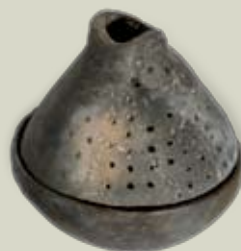
Stranier, Ridjage, Vinogradi, Younger Neolith

◀ Golden jewelry, Atenica, end of the 6 th and the beginning of the 5 th century B.C.