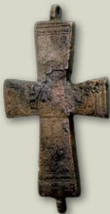
Enkolpion, Rudnik, 12 th - 13 th century