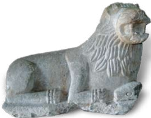
Stone lion, Prijevor, Culjevina, 5 th century