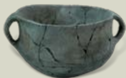
Dish, Gornja Gorevnica, Early Bronze Age

Under the protection of over lived culture of Starcevo a new, Vinca culture appeared and findings were in settlements in upper, naturally protected places, beside river flows: 'Poljicine' (Ostra), 'Trsine' (Gornja Gorevnica), 'Vinogradi' (Ridjage), 'Breg' (Guca) and 'Velikelivade' (Krstac). On the sunny slope above the river Cemernica in Gornja Gorevnica, a house of big dimensions whose roof was supported by wooden columns was researched.