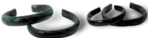
Bracelets, Gornji Branetici, Older Iron Age

Bronze Age in Lucani, Jancici, Krstac, Guca, Ducalovici and Donja Kravarica contain various jewelries: necklaces, bracelets, glasses or pipe like pendants, tutulas, saltaleons, needles and pincers, whose property was showing the social status of their owners. Urns' shapes and ornaments are connected with Vatina culture which appeared about 1600 B.C. Bronze Age ended by standing out first groups of pre Illyrians and pre Thracians and beginnings of ethnic forming old Balkanize tribes. Great migrations of peoples at the end of the 13 th